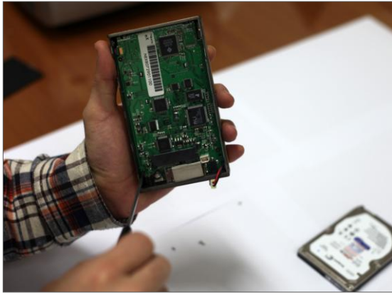
10. Screw to hold the PCB panel