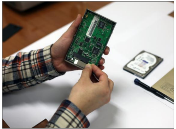
11. Connect the small-white battery connector