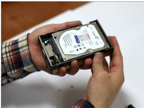
12. Mount the internal hard drive disk